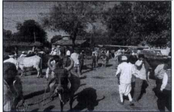
Clinical Camp jointly organised by Gauseva Samaj, Balagam, College of Vet. Science & A. H. and Animal Husbandry department, Junagadh