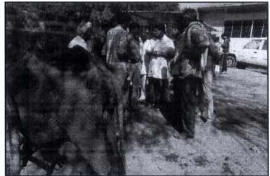
Medicinal treatment of different animals