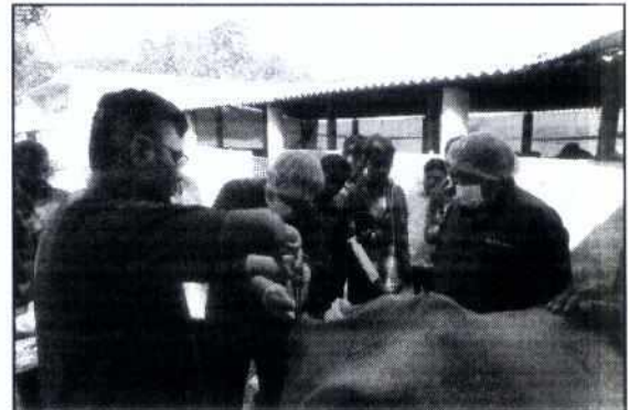
Surgical management of various cases